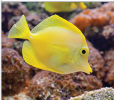
Yellow zebrasoma fish